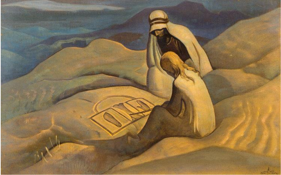
Signs of Christ (Nicholas Roerich)

Christ speaks to Master Morya about the Future ~