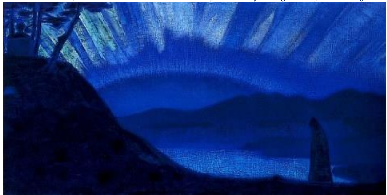
BRIDGE OF GLORY - Roerich

In Service of the Christ and the Great Ones for the Unfolding Soul of Humanity